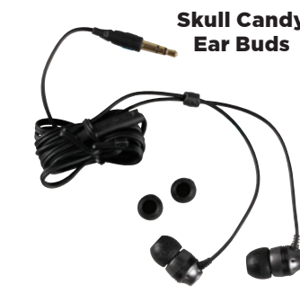
F. Skull Candy Inkd Ear Buds Item #53096010N.....$24.95