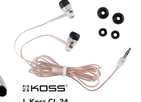
KOSS I. Koss CL-24 Ear Buds • 3 Shapes Item #51842010N .....$21.45