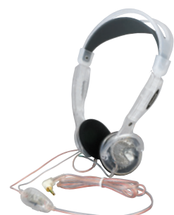
F. KOSS CL-PRO Clear Headphones Item #50662010N .....$18.10