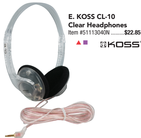
E. KOSS CL-10 Clear Headphones Item #51113040N .....$22.85