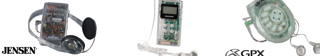
JENSEN C. JENSEN JSR-1000 Clear AM/FM Radio Item #72066010N .....$19.55