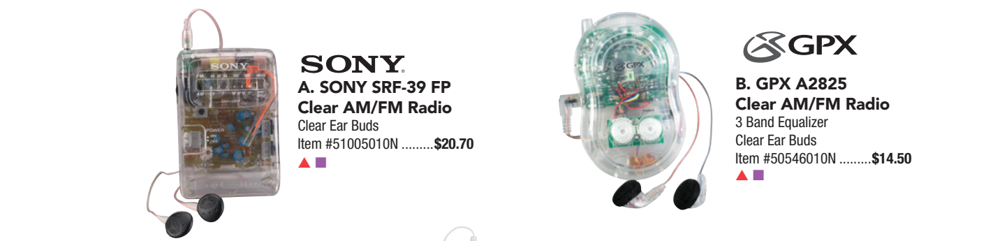
SONY A. SONY SRF-39 FP Clear AM/FM Radio Clear Ear Buds Item #51005010N .....$20.70

Privilege Group A = ▲ Privilege Group B = ■ Privilege Group D = ●