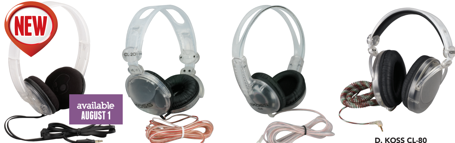
A. Skull Candy Clear Headphones Item #53263010N .....$34.95