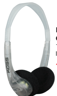
K. KOSS CL-2 Clear Headphones 1 Year Limited Warranty Item #51281010N .....$6.40