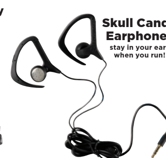
G. Skull Candy Chops Earphones Item #53097010N.....$29.95