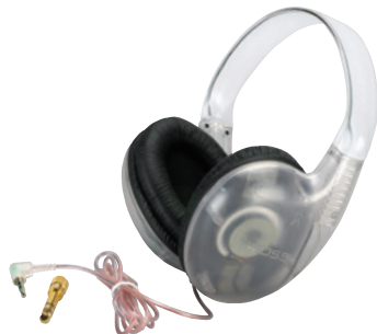
G. KOSS CL-19 Clear Headphones Item #50663010N .....$18.10