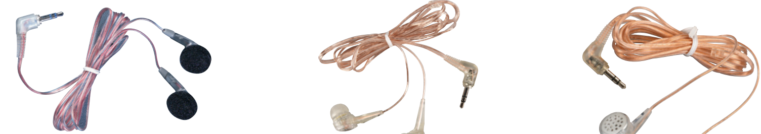
KOSS C. KOSS CL-3 Clear Ear Buds Item #50294010N .....$3.85