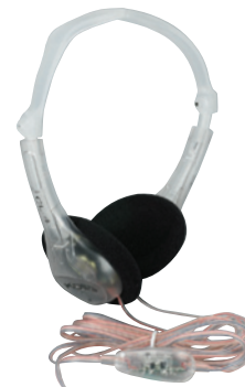
H. KOSS CL-4 Clear Headphones In-Line Volume Control 1 Year Limited Warranty Item #51283010N .....$13.10