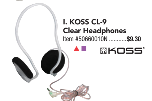
I. KOSS CL-9 Clear Headphones Item #50660010N .....$9.30