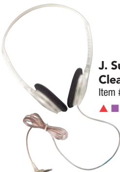
J. Sunsport Clear Headphones Item #51389010N .....$9.10