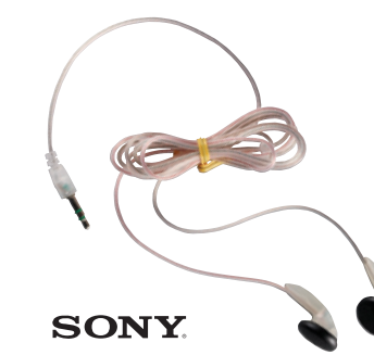
SONY H. Sony Clear Ear Buds Item #50755010N.....$9.80