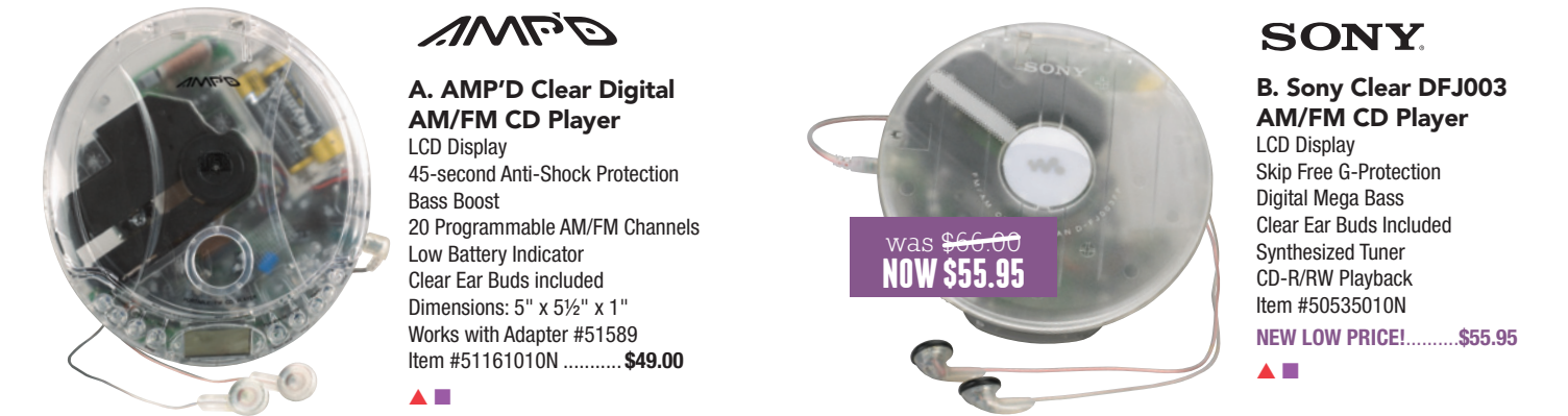
AMP'D A. AMP'D Clear Digital AM/FM CD Player LCD Display 45-second Anti-Shock Protection Bass Boost 20 Programmable AM/FM Channels Low Battery Indicator Clear Ear Buds included Dimensions: 5" x 5½" x 1" Works with Adapter #51589 Item #51161010N .....$49.00

Privilege Group A = ▲ Privilege Group B = ■ Privilege Group D = ●